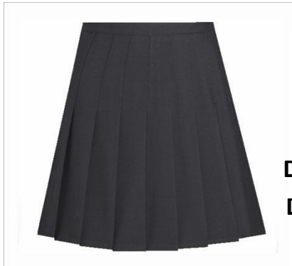
David Luke Stitch Down Pleat Skirt